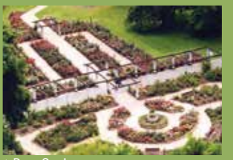
↑ Rose Garden