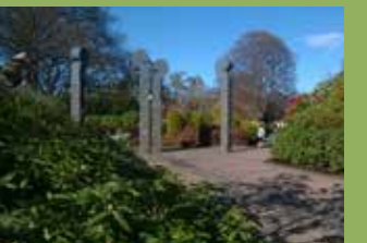
↑ Entrance via Gt King Street/Opoho Road