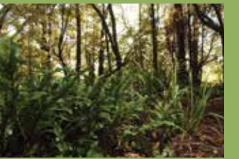
↑ Lovelock Bush