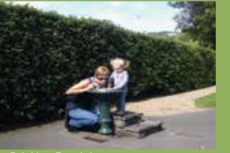
↑ Drinking Fountain