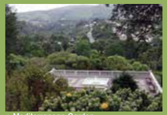
↑ Mediterranean Garden