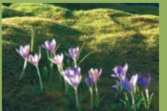
↑ Rock Garden