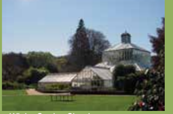
↑ Winter Garden Glasshouse