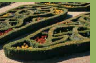
↑ Knot Garden