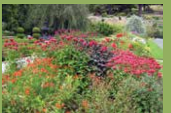
↑ Herbaceous Borders