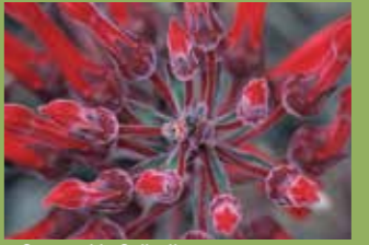
↑ Geographic Collection