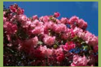
↑ Rhododendron Dell