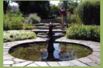
↑ Herb Garden