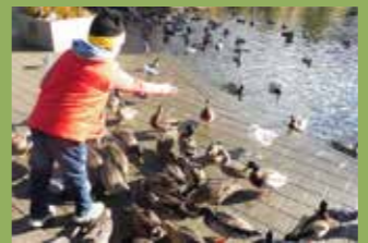
↑ Feeding the Ducks